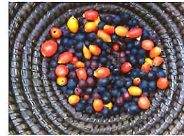
Traditional Food Gathering was part of the bush camp facilitator training.

In January / August of 2017 we offered Facilitator Training which was well attended. Approximately 15 students were taught how to conduct a bush camp, they experienced a hands approach to facilitate a bush camp from beginning to end.