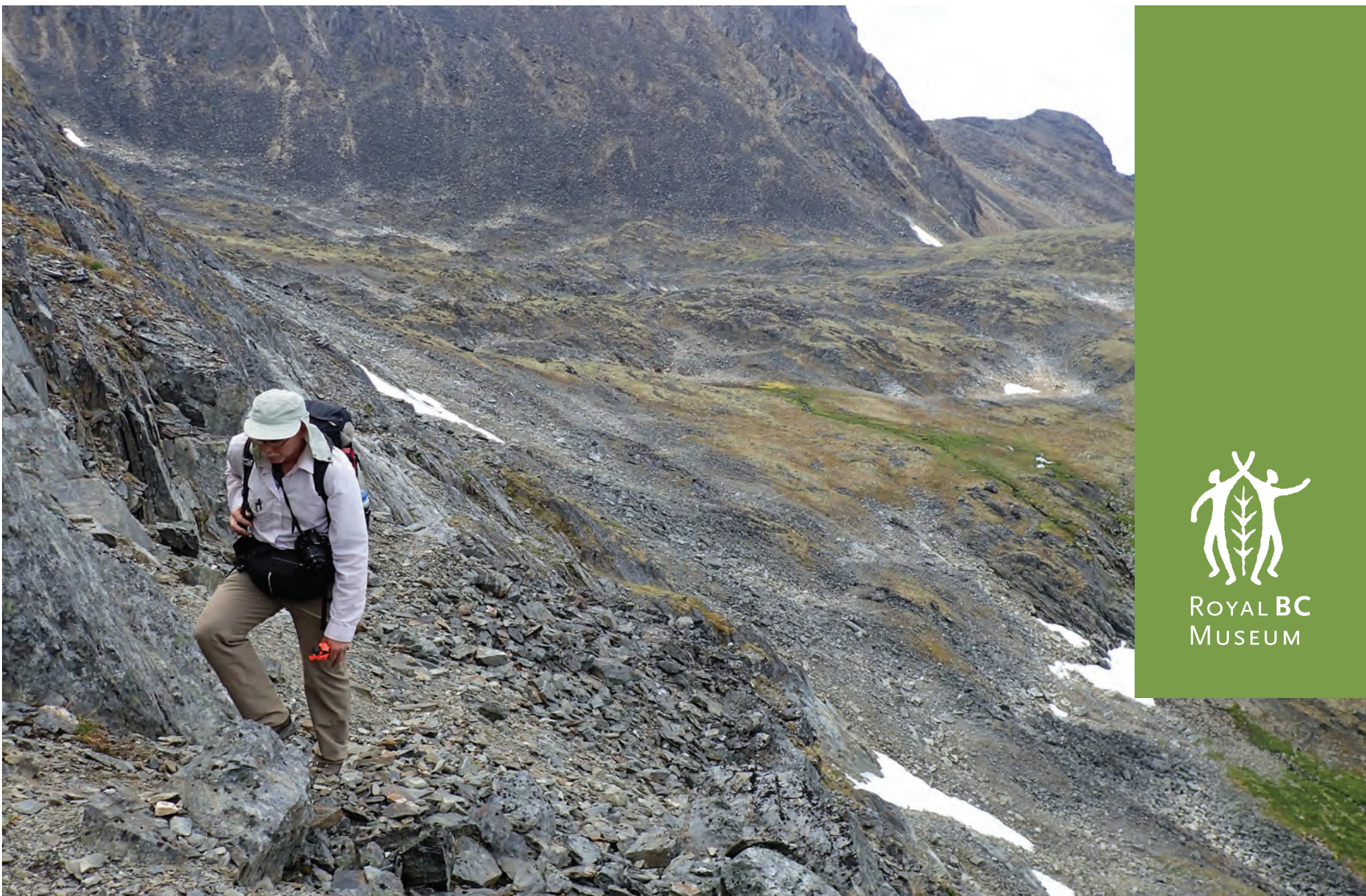
Northern BC alpine landscape